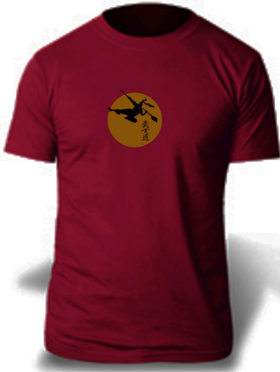
Front of shirt